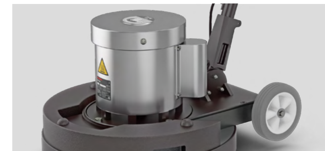
Maintenance-free planetary gear